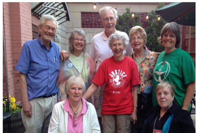
UJME & Me at Union Station Brewery