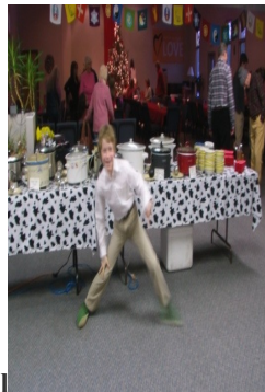
Soup & Dessert Dinner