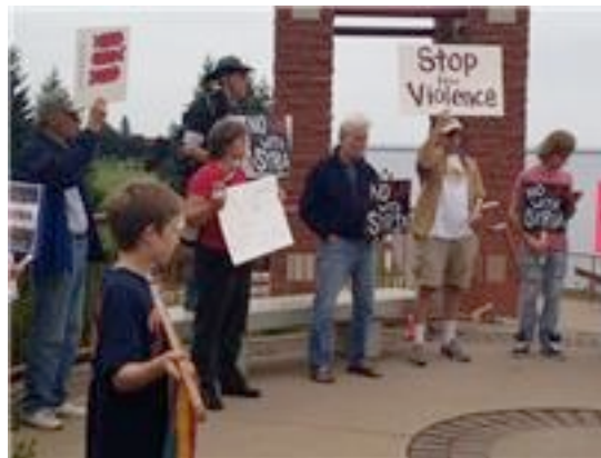
Mgt. UU members and youth joined by others in object of US entering war with Syria.