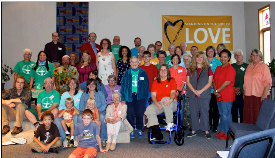
Marquette Unitarian Universalist Congregation, September 8, 2013 Ingathering: Water Ceremony