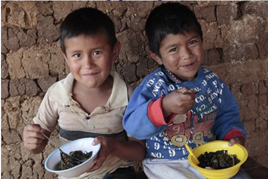
Heifer International Soup & Dessert Dinner

If you were unable to be with us on Sun., Nov. 24 when we opened our Guest at Your Table program, please be sure to pick up your Stories of Hope booklet and an envelope or box in the basket by the Appreciation Board and the Suggestion Box. If you prefer, you can make your contribution directly online at uusc.org/givetoguest .