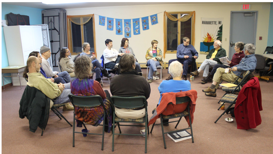
Newcomers meet Congregation leaders