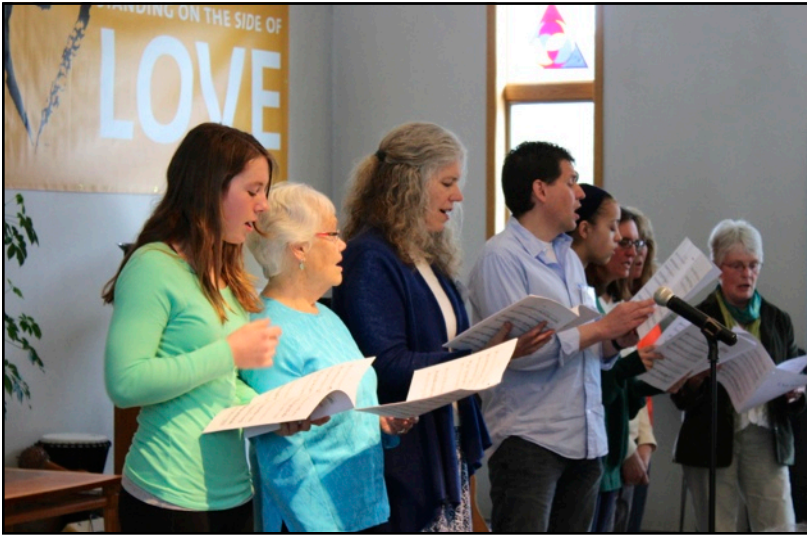
Mqt. UU Choir