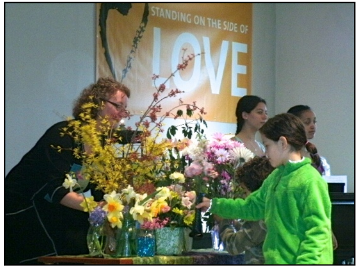
Flower Communion wrapping up our church year.